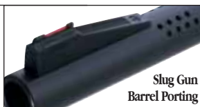
Slug Gun Barrel Porting

The Rossi Slug Gun barrel is ported. These ports can emit sparks and hot gases when the firearm is discharged.